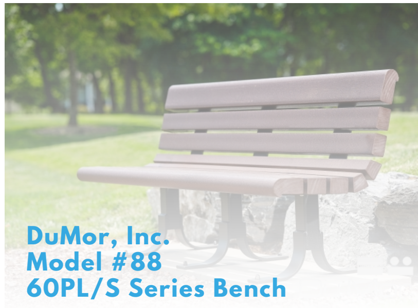
DuMor, Inc. Model #88 60PL/S Series Bench (shown above)

Complete Bench Includes: Victorian Style Bench Supports Bench Slats 2" x 10" Dedication Plaque (Maximum of 4 lines with 37 characters per line) Installation and Maintenance $2,600.00