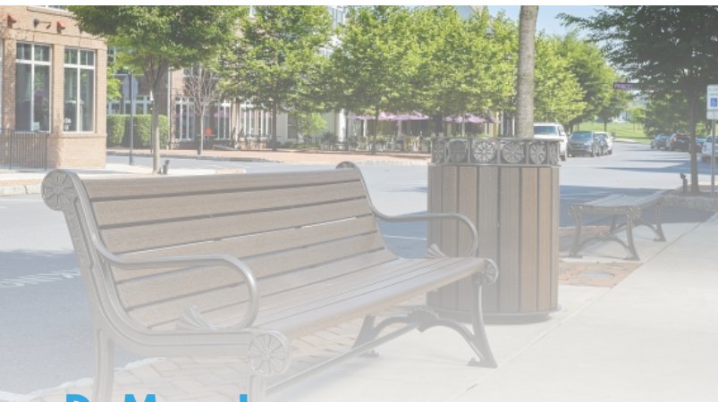
DuMor, Inc. Model #57 60PL Series Bench (shown above)

Complete Bench Includes: Victorian Style Bench Supports Bench Slats 2" x 10" Dedication Plaque (Maximum of 4 lines with 37 characters per line) Installation and Maintenance $2,600.00