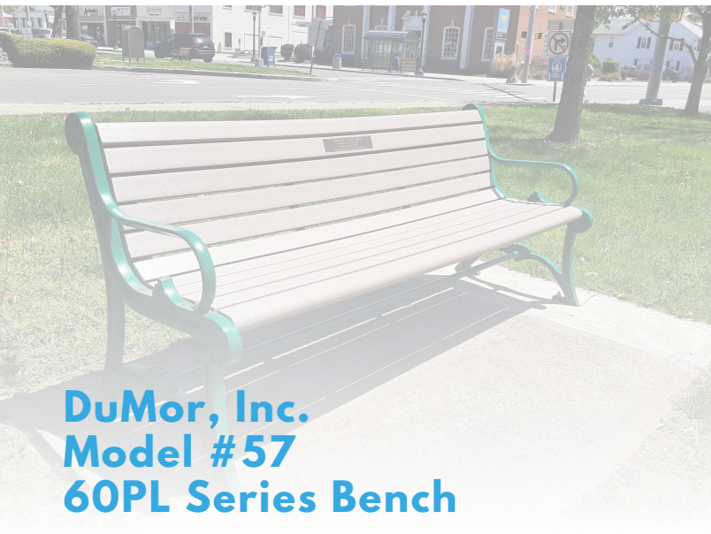
DuMor, Inc. Model #57 60PL Series Bench (shown above)

Complete Bench Includes: Victorian Style Bench Supports Bench Slats 2" x 10" Dedication Plaque (Maximum of 4 lines with 37 characters per line) Installation and Maintenance $2,600.00