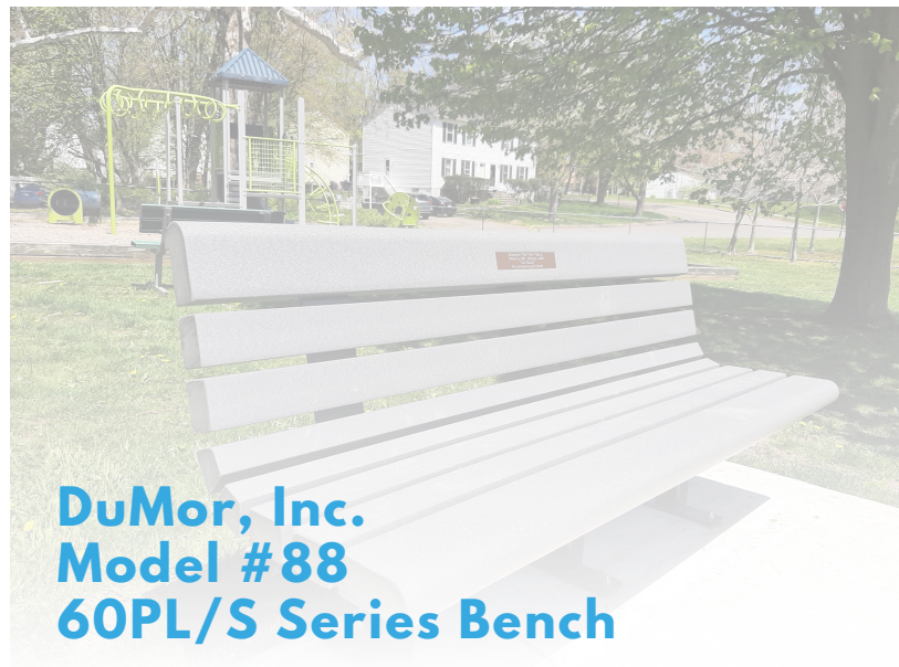
DuMor, Inc. Model #88 60PL/S Series Bench (shown above)

Complete Bench Includes: Victorian Style Bench Supports Bench Slats 2" x 10" Dedication Plaque (Maximum of 4 lines with 37 characters per line) Installation and Maintenance $2,600.00